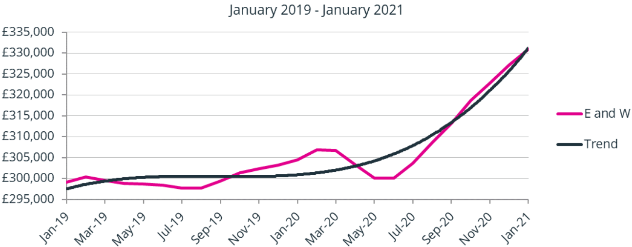
Figure 1. The average house price in England and Wales, January 2019 – January 2021 Link to source Excel

Average House Prices in England and Wales