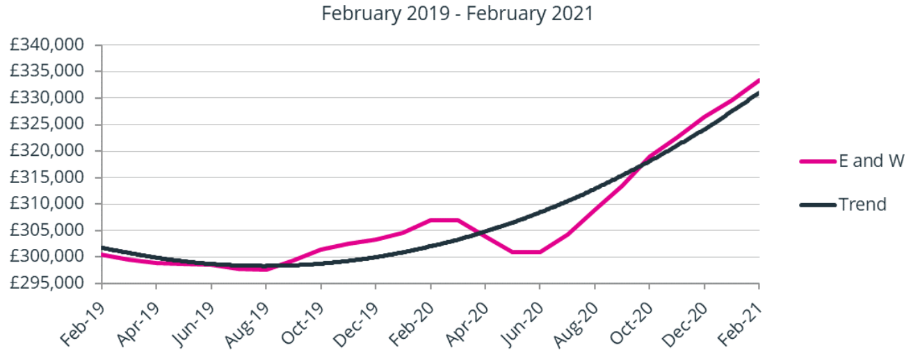
Figure 1. The average house price in England and Wales, February 2019 – February 2021 Link to source Excel

House prices in February continued to advance, rising by 8.6% in the last twelve months. Figure 1 charts prices during the pandemic, with an initial dip in early 2020 linked to the first lockdown in the UK from March to June, followed by eight consecutive months of price growth as lifestyle changes and the stamp duty holiday began to influence demand. As the lines show, price growth has been accelerating.